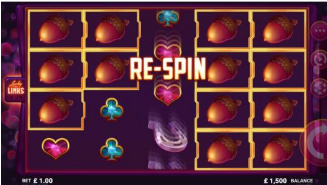
Base Game Excitement Feature